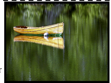
'Mystery Bay'